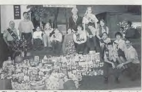
The Battle Creek Tabernacle held a Festival of Praise for the items collected by their Pathfinder Club for food baskets during the holidays.

One family with five children was in real need. The father had worked for a local church member for many years. When that member retired and closed his business, the father was left without a job to support his family. Finally he found a part-time job where he could work 15-20 hours per week at $5.75 per hour. Not a lot to support his family with, but at least it was