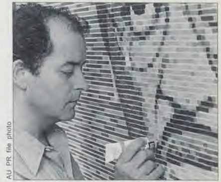
Portrait of the artist as a 1970s man.

nevertempted him to sacrifice the principles learned and taught in the other. "I have always been a Christian artist, and this is how I've always identified myself," he said. Nothing split about it.