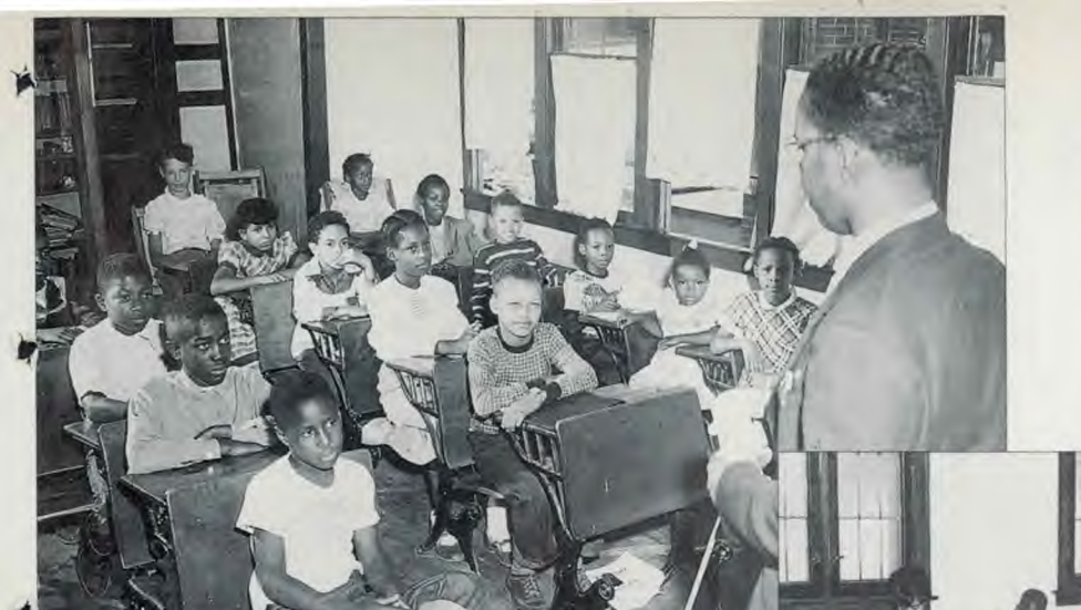
Education has been one of the priorities of the Lake Region conference. Children look much the same in every

era, but their surroundings change with the times.