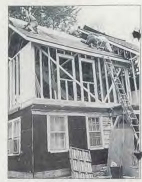
South Haven Church members came to the aid of the Schmeling family by closing off a new addition and roof before the rain came.

The task was not an easy one, for it required rafters in some areas, plus sheeting, tar paper, and shingles. However, at the end of the day, only three-fourths of the shingles on the big project were yet to be completed. Women from the church brought a noon meal for the working crew, and Mike's wife, Kelly, worked raking up the debris while still caring for her three preschool children.