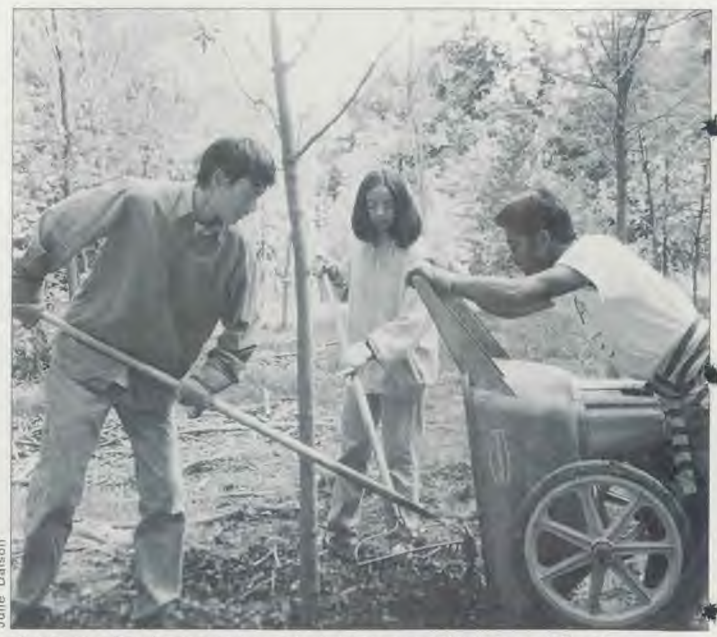
Andrews Academy seniors plant trees as volunteers at the Open Lands Project in Chicago.

Michigan — Early on Sept. 21, 1997, 62 seniors from Andrews Academy volunteered their time to the Open Lands Project in Chicago. The Open Lands Project is a nonprofit organization