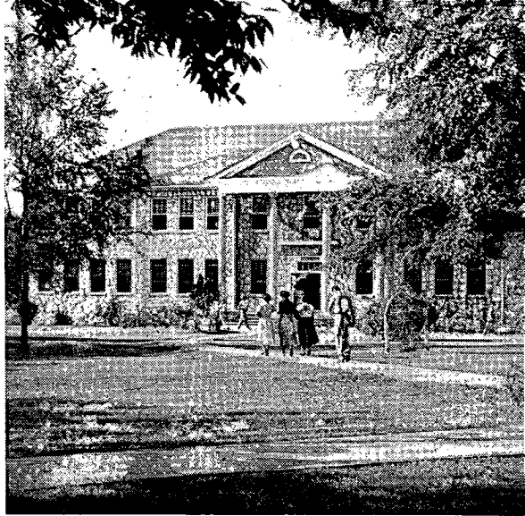
Oakwood College, Huntsville, Alabama, was established to train youth for God's service.