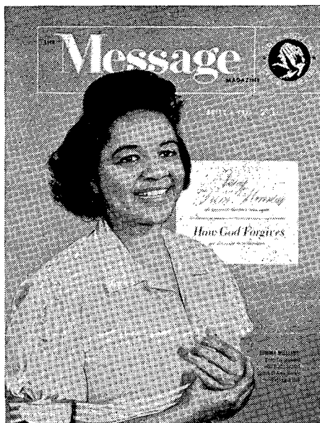
The "Message" Magazine, a missionary journal for Negroes, begun in 1935.

order to improve the organization and to intensify evangelism, five Regional conferences were created in 1944, and they have since increased to seven. These sustain the same relationship to the respective union conferences as do any other local conferences within the territories of the union conferences which have a large Negro membership. They are: The Northeastern Conference, Atlantic Union; the Allegheny Conference, Columbia Union; the Lake Region Conference, Lake Union; the South Atlantic Conference and the South Central Conference, Southern Union; the Southwest Region Conference, Southwestern Union; the Central States Conference, Central Union. By 1954, when the